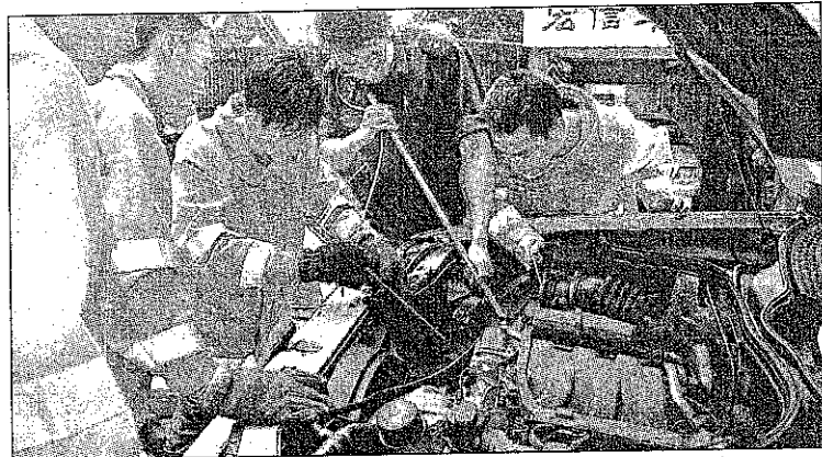
Firemen try to help the kitten which became stuck in the engine of a car.

"It is a four-wheel-drive convertible Mercedes, a very expensive car, and he didn't have insurance